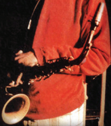
FIGURE & SPIRIT