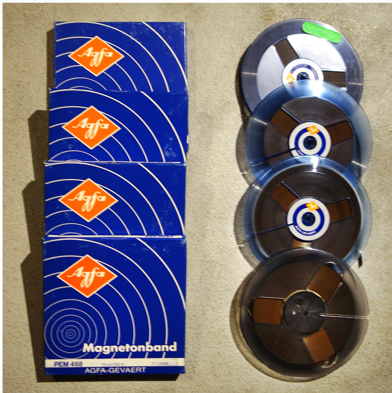
Audio Reels and Boxes